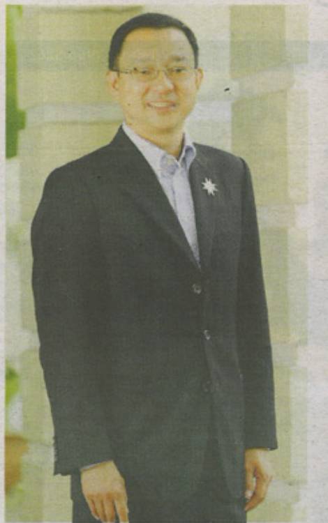
Boon: The building industry needs to progress to proactively seek new potential and possibilities.